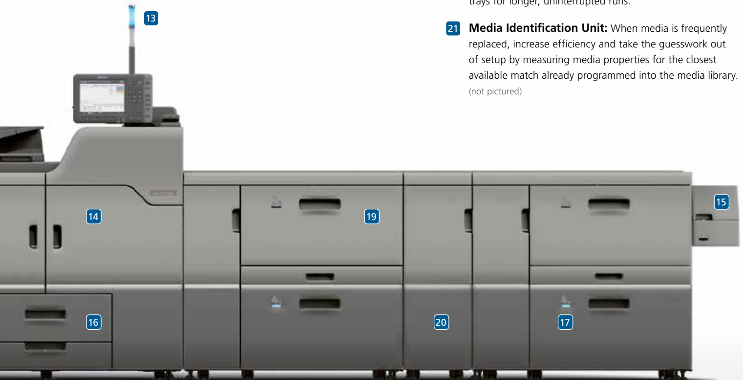
RICOH Pro C7110S