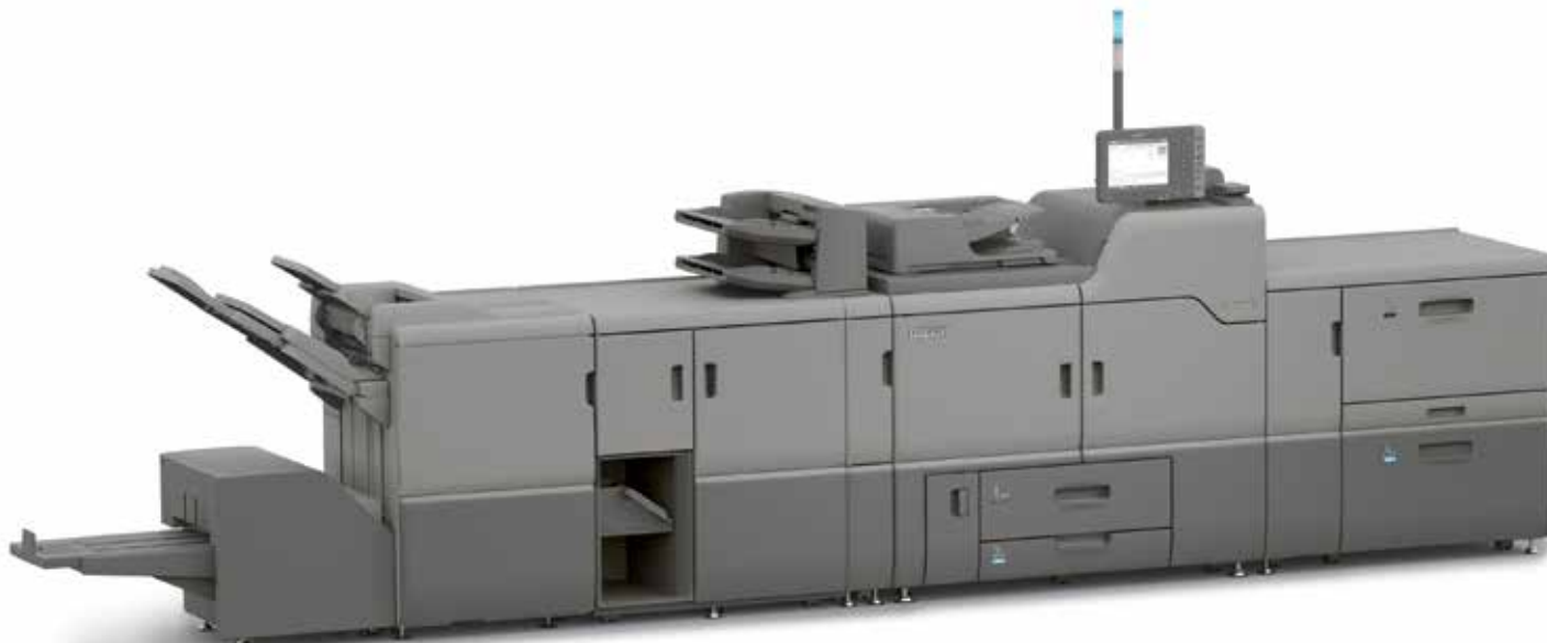
RICOH Pro C7100S

For maximum performance and yield, we recommend using genuine Ricoh parts and supplies.